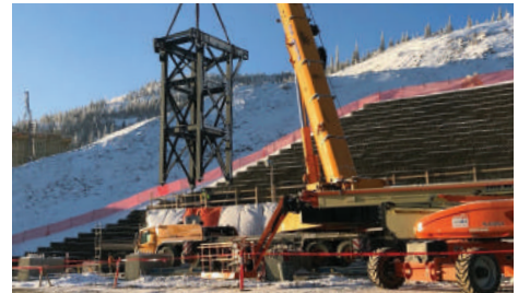
/ Installing structural steel at the Secondary Crusher.