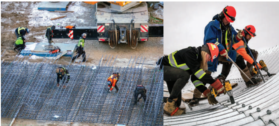
/ Yukoners at Work preparing rebar for the Primary Crusher, and installing the CSP tunnel at the Coarse Ore Stockpile.