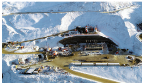
/ Aerial view of the Secondary/Tertiary Crusher facility.

Check out the Construction Progress videos on our website at vitgoldcorp.com