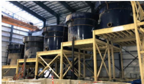
/ The interior of the Gold Recovery Plant.