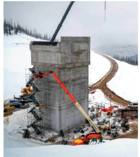
/ Pouring concrete at the Primary Crusher almost complete.

The gold recovery plant is well ahead of schedule and is now fully enclosed with all 10 carbon columns in place with the overhead crane, commissioned and in use, actively placing internal steel and plant equipment.