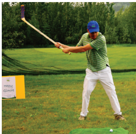
/ The challenge at the Happy Gilmore hole!

With thanks to our community partners and supporters, Victoria Gold raised $30,000 for Every Student, Every Day at our first golf tournament held in Dawson on June 30th, 2018.