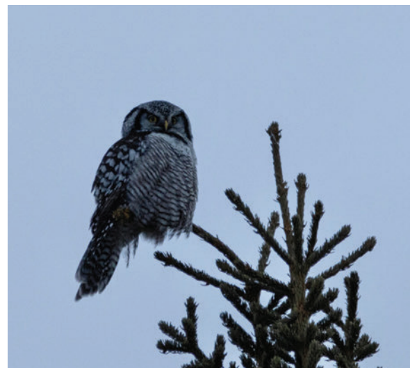
Wildlife observations from the Eagle Gold Mine site.

At Victoria Gold's Eagle Gold Mine, wildlife protection is an important element of the Company's corporate culture and the entire team's commitment to environmental responsibility.