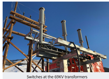
Switches at the 69KV transformers