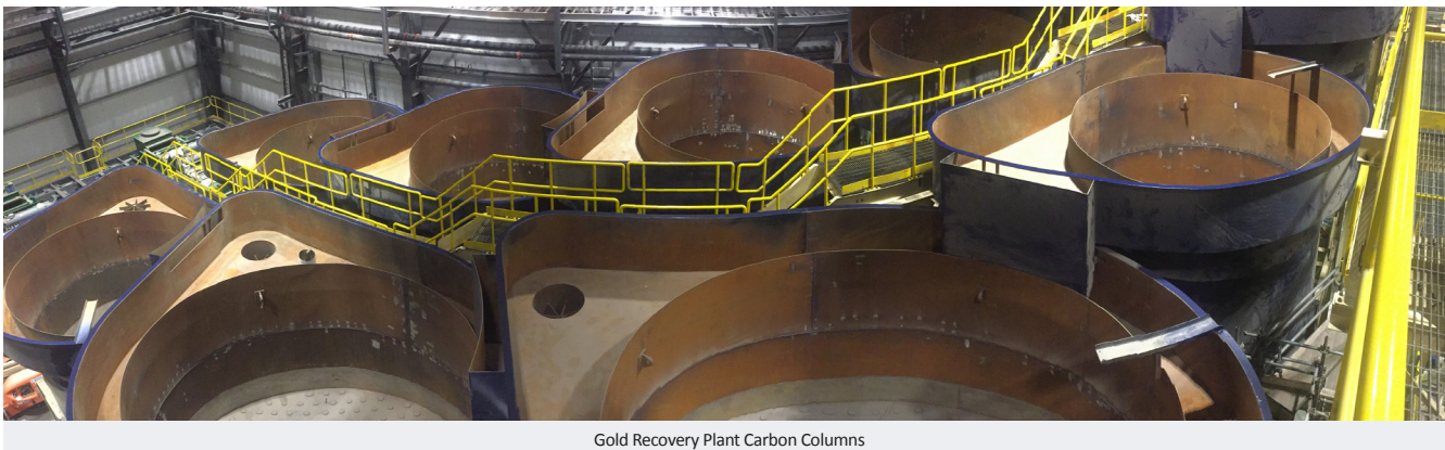
Gold Recovery Plant Carbon Columns