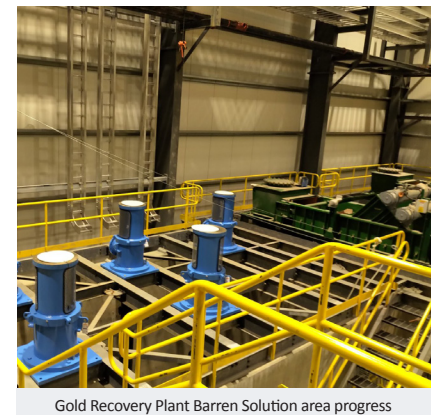
Gold Recovery Plant Barren Solution area progress